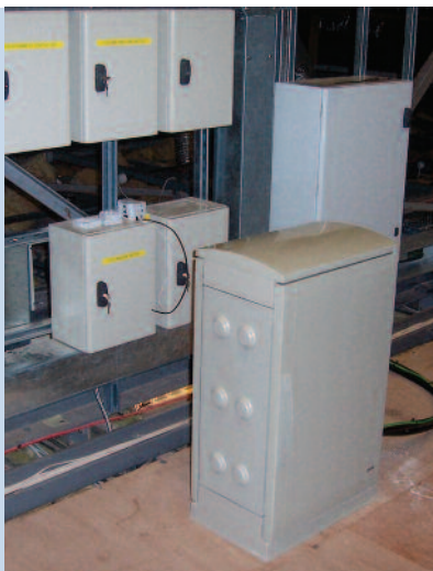
left side view