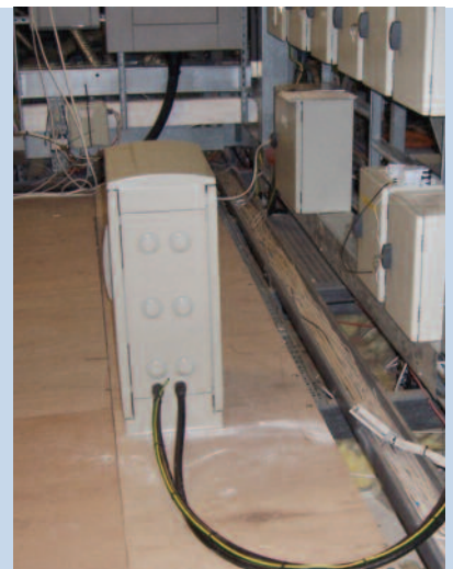
right side view